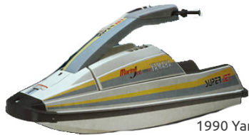
1990 Yamaha 650 SuperJet

For 2021 the SuperJet returns, all new from the ground up to challenge for a new generation of stand up riders.