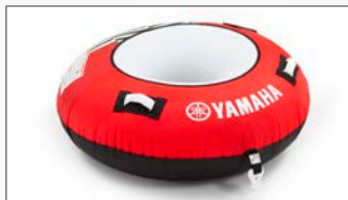
Funtube 1 Person