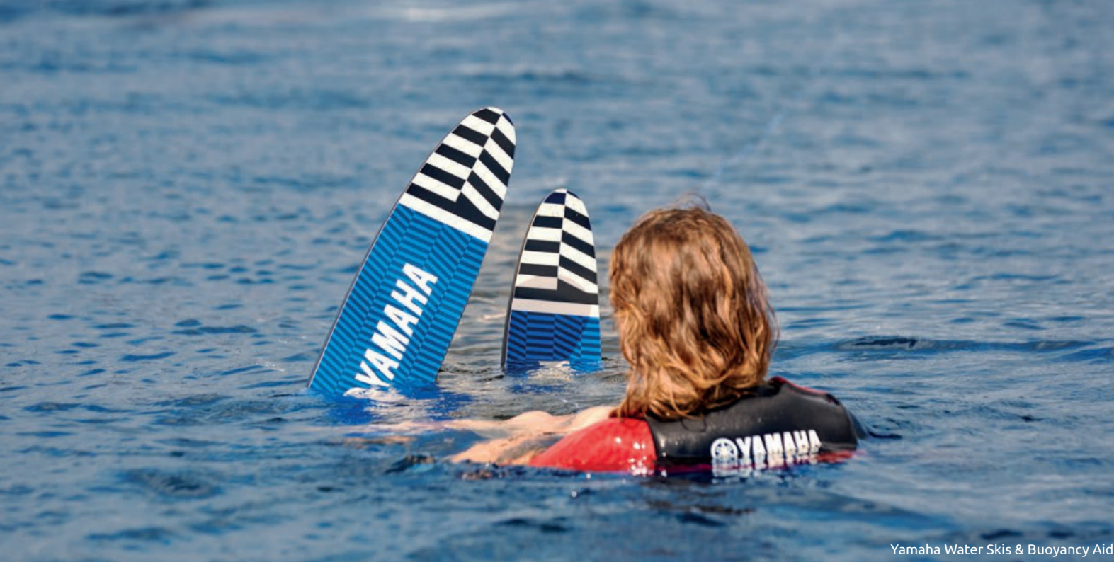
Yamaha Water Skis & Buoyancy Aid