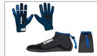
Neoprene Shoes & Gloves