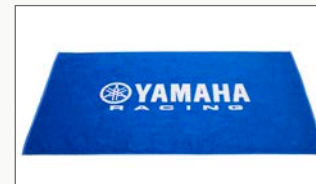
Blue Beach Towel