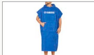
Adults Poncho Towel