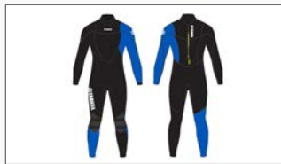
Full Wetsuit 3mm/2mm