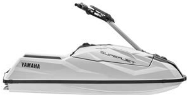
All new 2021