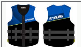
Front Entry Buoyancy Vest